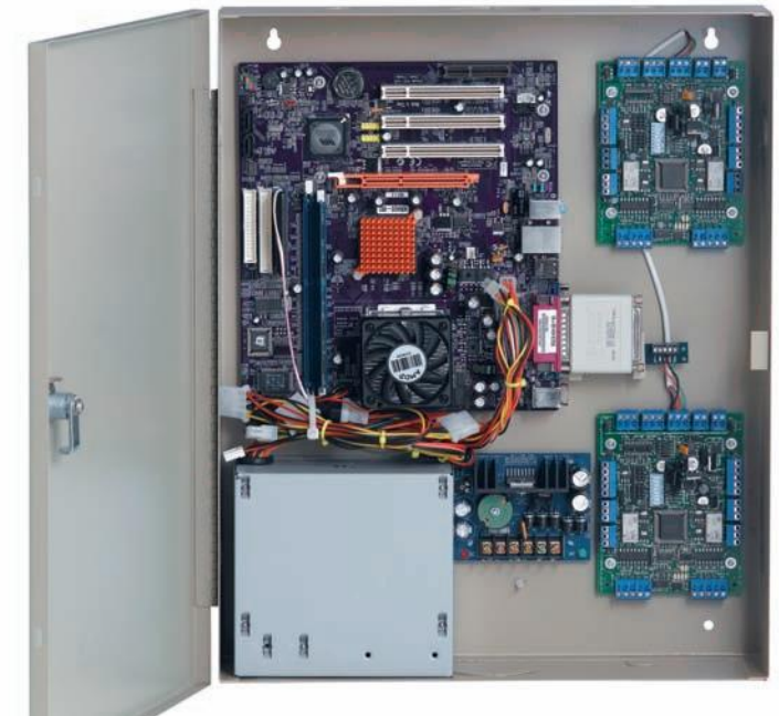
System V Web-based Panel

System V is the EMS premier web-based product, designed for medium to enterprise-scale commercial system needs. Monitor all aspects of your security from any computer using a browser or a smart phone; monitor video and control multiple sites from interactive mapping displays. Options include biometric and photo-badging interface. System V is expandable, easily integrated and offers customizable reporting.