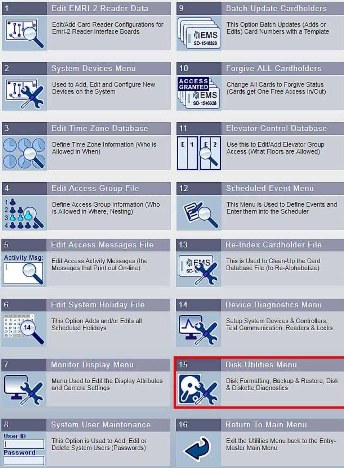
Figure 4-2. Utilities Menu