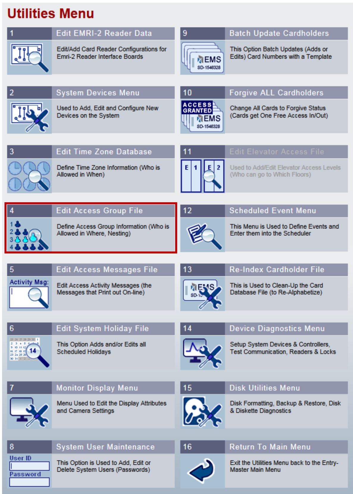
Figure 2-6-2. The Entry-Master Utilities Menu

Step 2: Selected the Edit Access Group File link and the following screen displays: