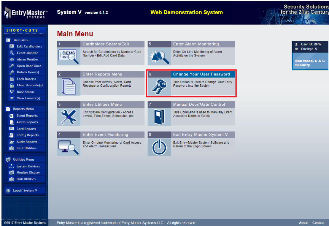
Figure 2-3-1. Selecting Change Your User Password from the Main Menu

While logged into the Entry-Master System. From the Main Menu , click on Option 6 – Change Your User Password (Figure 2-3-1 below):