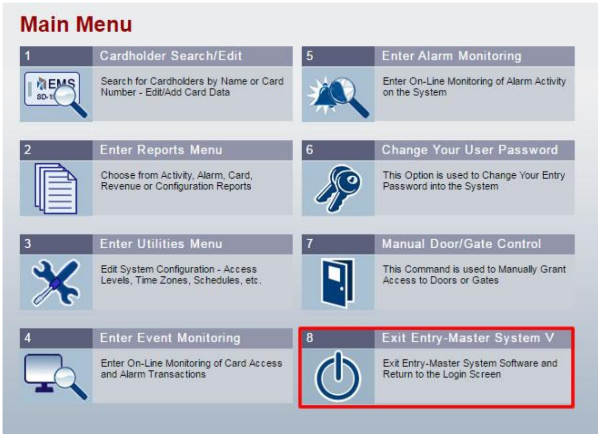
Figure 2-2-2. Exit Button on “Main Menu” Page

There is also a “Logoff” button on the Main Menu: