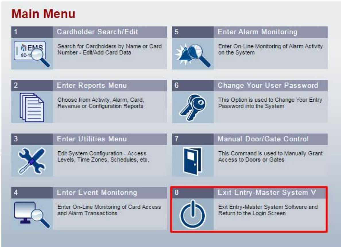
Figure 2-2-2. Exit Button on “Main Menu” Page

There is also a “Logoff” button on the Main Menu: