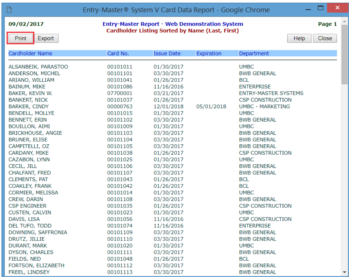
Figure 2-14-5. – Card Data Report Screen

Click on the Run button to create a report that will display on the screen. A sample report is shown next (Figure 2-14-5):