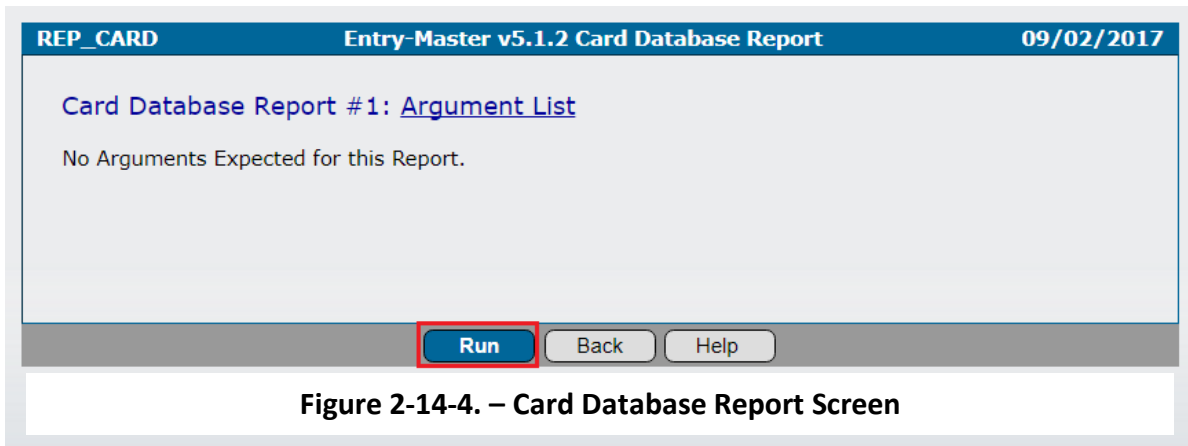
Figure 2-14-4. – Card Database Report Screen

The Card Database Report screen displays (Figure 2-14-4):