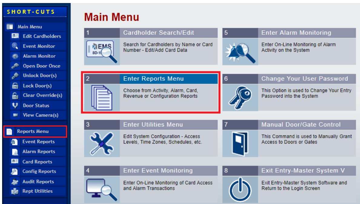
Figure 2-14-1. Main Menu – Reports Menu

From the Main Menu select Option 2, Enter Reports Menu :