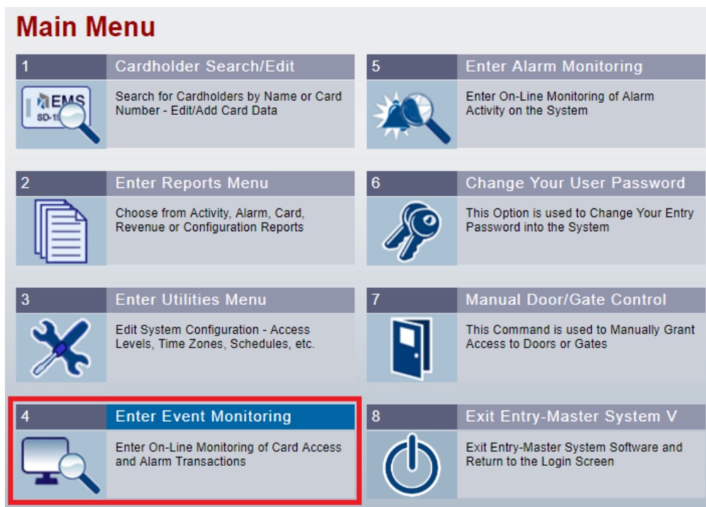
Figure 2-13-1. Main Menu – Enter Event Monitoring

To display the On-line Monitoring screen from the, Select Option 4, Enter Event Monitoring from the Main Menu (See Chapter 2 - Lesson 1, Logging into the System ).