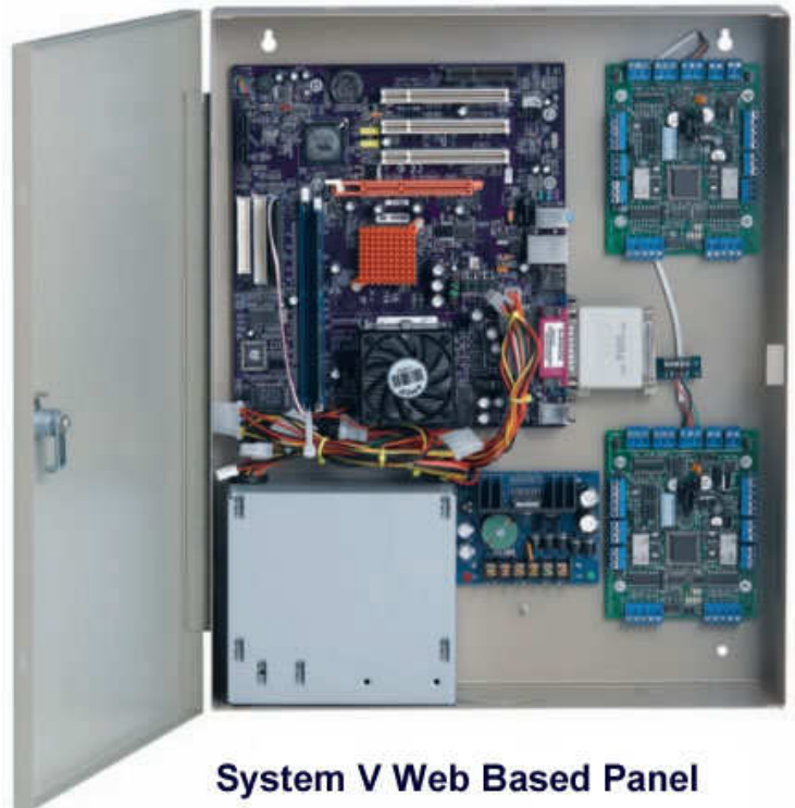
System V Web Based Panel