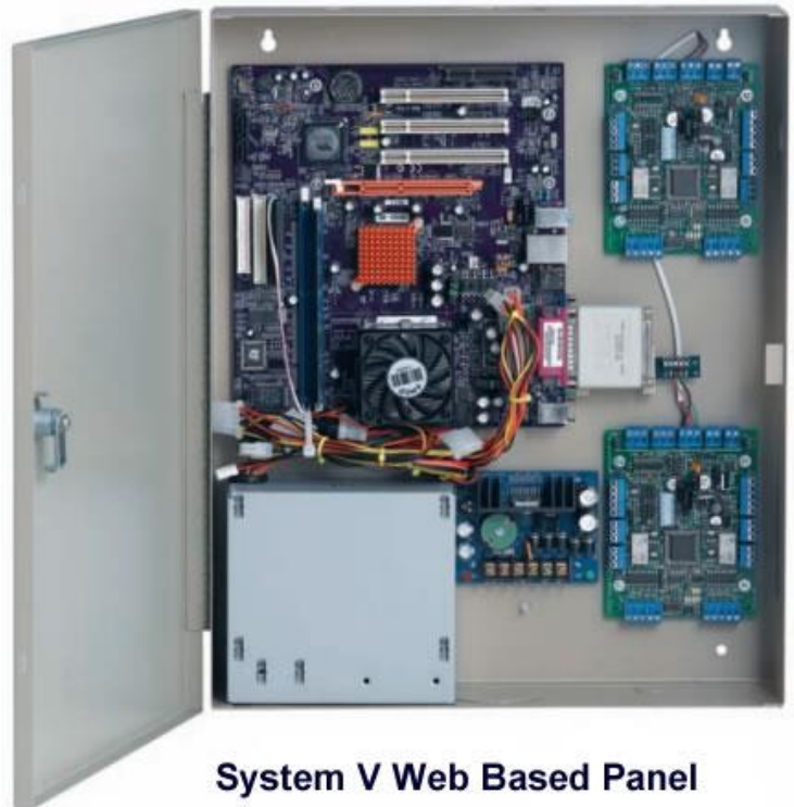
System V Web Based Panel