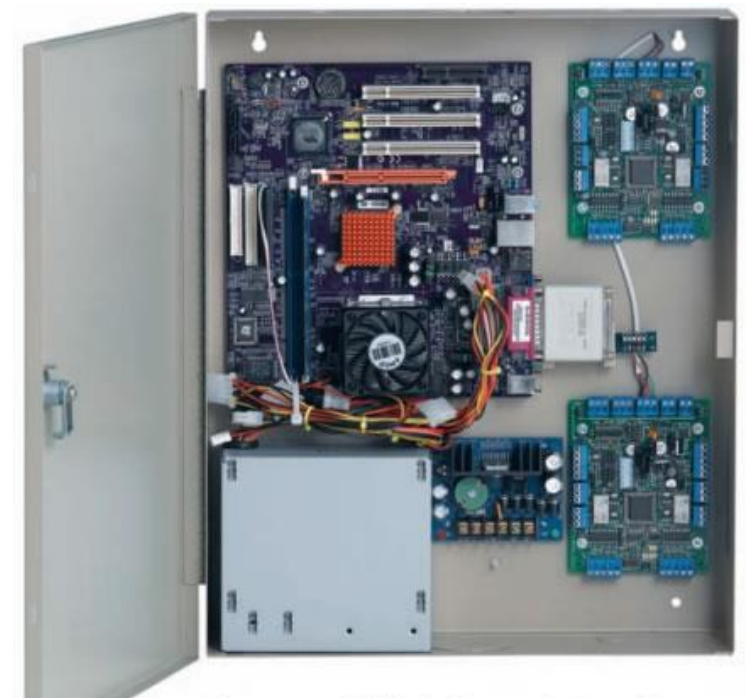
System V Web Based Panel